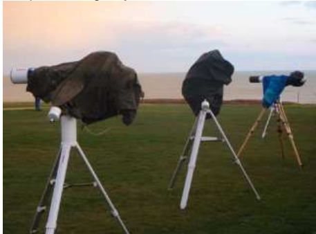
Telescopes During Daytime

The location offered almost 180-degree southerly views across the Channel, and, combined with ensuite rooms and a great cooked breakfast offered by Brighstone Holiday Centre , even island astronomers were tempted to stay on site. On all four nights the clouds parted to give wonderful clear skies.