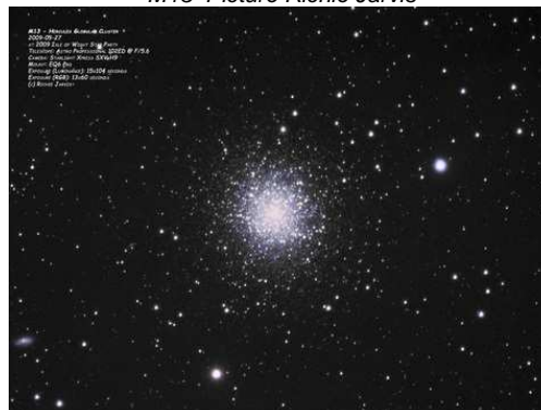
M13

Wonderful astro-images of the Witch's Broom (NGC6960, part of the Veil (nebula) and the Rosette nebula were also taken.