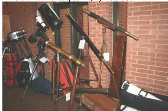
Old & New Telescopes Display Picture John Axtell

As well as a good variety of speakers there were also many trade stands and static displays, both days were extremely well attended. Thanks go to the organisers at Astronomy Now magazine.