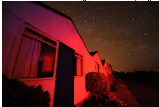
Stars And Chalets In Red Light

The warm tea and coffee room, lit with a red bulb, was very useful, and helped to keep the astronomers going all night, every night. Sky Quality Meters were used to officially record just how dark the skies are, and, with a maximum of 21.3, it was confirmed that the island does indeed have some of the darkest skies in the south of England.